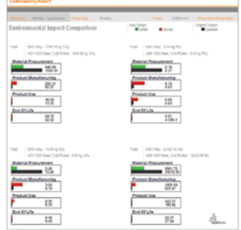
A detailed, professional, sustainable design report directly from SolidWorks Sustainability